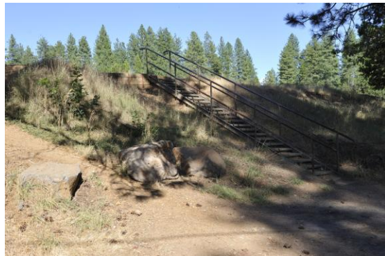
STAIRS FROM PARKING AREA